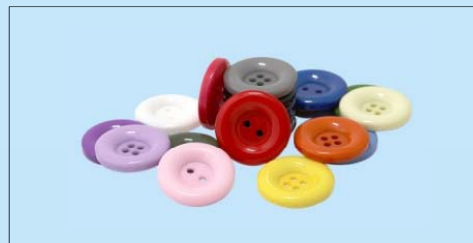
四孔和二孔鈕扣 4-hole and 2-hole Button