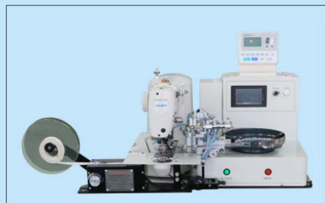
配合選購件NS-100-2操作 Used in combination with NS-100-2